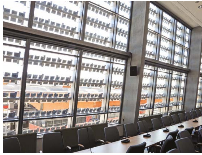
Budomierz / Roadway State Border Checkpoint