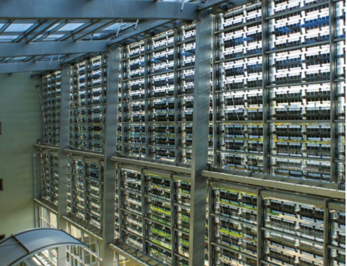
Krakow / Jagiellonian University

ML System S.A. Administration/Manufacturing plant Zaczernie 190 G, 36-062 Zaczernie Tel. No. 17 7788266, Fax No. 17 8535877 e-mail: biuro@mlsystem.pl, www.mlsystem.pl VAT No.: 517-02-04-997